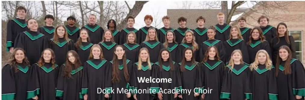
Welcome Dock Mennonite Academy Choir