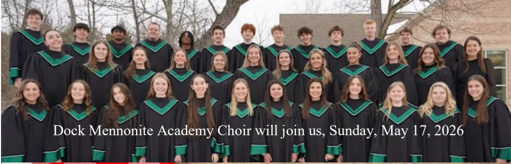
Dock Mennonite Academy Choir will join us, Sunday, May 17, 2026