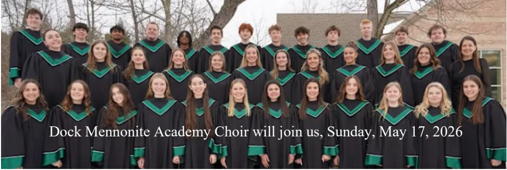
Dock Mennonite Academy Choir will join us, Sunday, May 17, 2026