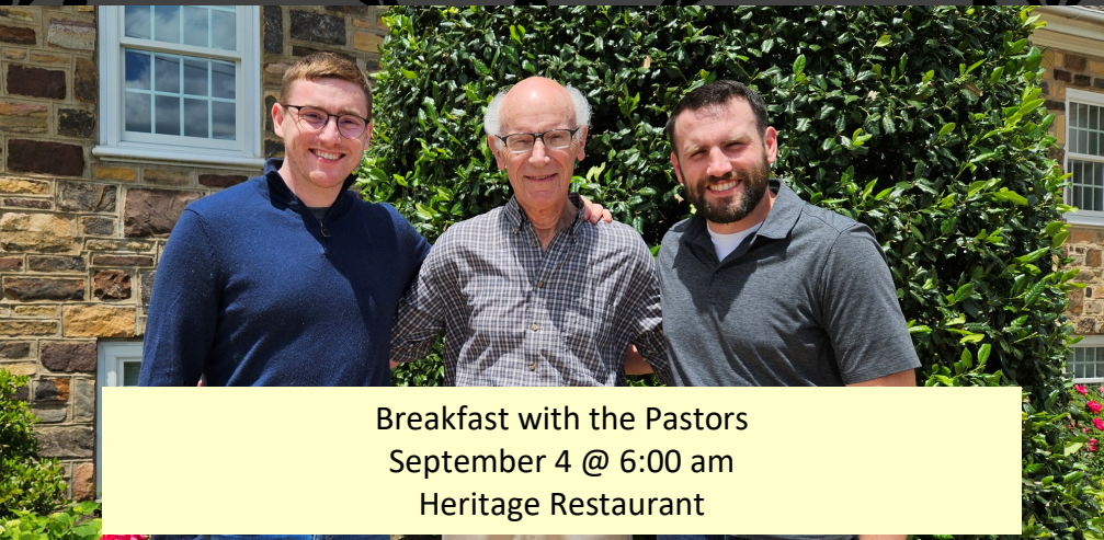
Breakfast with the Pastors September 4 @ 6:00 am Heritage Restaurant