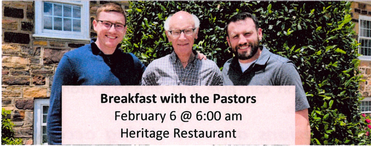
Breakfast with the Pastors February 6 @ 6:00 am Heritage Restaurant