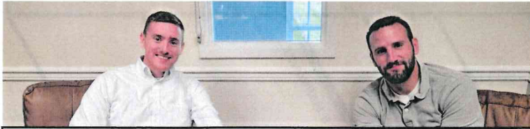
Breakfast with the Pastors, Thursday, November 2 @ 6 am Heritage Restaurant