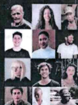
ENCOURAGING GOD STORIES FROM ACROSS THE U.S.