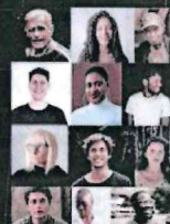
ENCOURAGING GOD STORIES FROM ACROSS THE U.S.