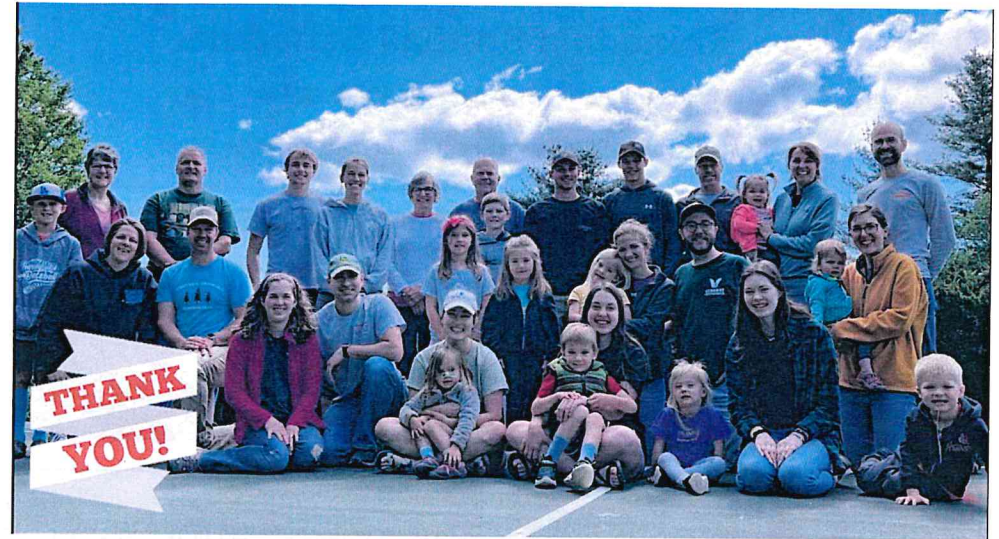
Thank you for your prayers and donations. We had a wonderful weekend serving together at Bethany Birches Camp.