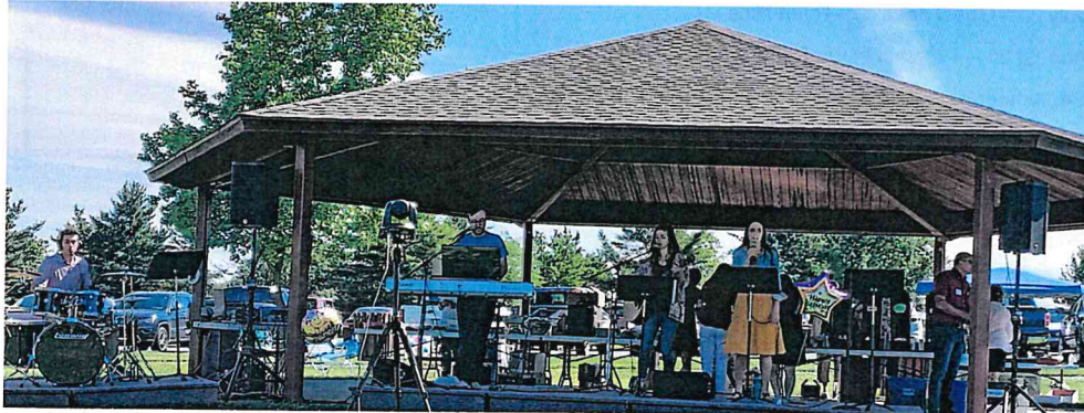
Thank you Kitchen Committee and volunteers for all you did to make this service a success!