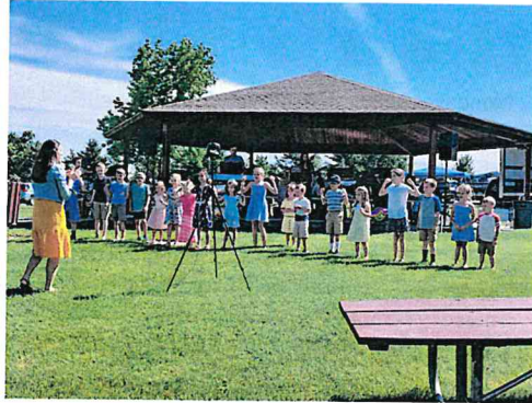
Thank you Worship, Community Life, and Outreach Committees for planning our Worship in the Park