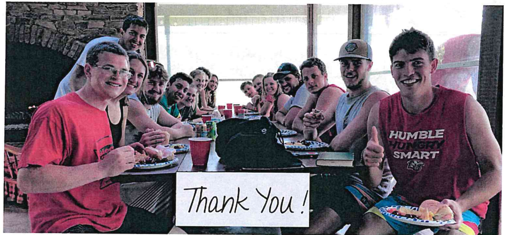
A big thank you to everyone who came out and supported the young adult pulled pork drive thru meal on Friday. Your support of more than $6,000 for the young people of this church is greatly appreciated. Please keep the group in your prayers as we head to Grand Lake, CO on June 26 as we participate in a week long MDS assignment. Franconia Young Adults