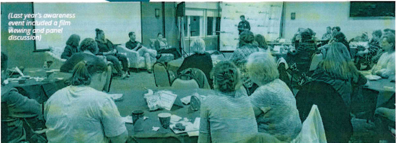
(Last year's awareness event included a film viewing and panel discussion)

Did you know that because of the prayer and financial support we receive from churches like Franconia Mennonite and church members like you, Worthwhile Wear now provides the most comprehensive care for survivors in PA. This year we will be expanding our community empowerment program, Worth It, to offer a virtual option for survivors across the country. Thank you for supporting the women Worthwhile Wear serves!