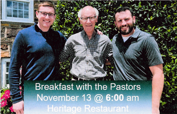
Breakfast with the Pastors November 13 @ 6:00 am Heritage Restaurant