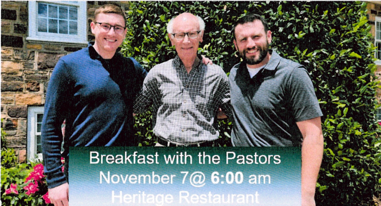
Breakfast with the Pastors November 7 @ 6:00 am Heritage Restaurant