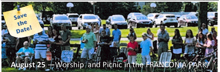
August 25 —Worship and Picnic in the FRANCONIA PARK

The children are collecting an offering to provide new shoes for 30 Liberian students. The shoes are part of their required school uniforms. Each pair of shoes costs $10. If you would like to contribute to this special offering project you can bring donations to the children's singing room.