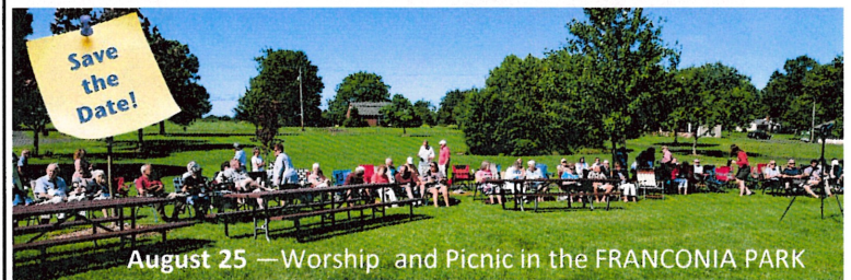
August 25 — Worship and Picnic in the FRANCONIA PARK

Children ages 4 thru 5th grade will be combined Sunday School classes for the month of July & August meeting in the singing room.