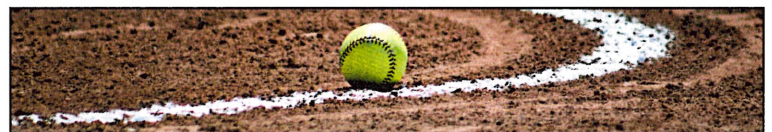
Franconia's 2024 Softball Schedule