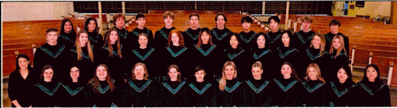
Dock Touring Choir will be leading us in a time of worship next Sunday, April 14. "Led with Love"

Dinner will be served at 6pm—Worship will start at 6:45pm.